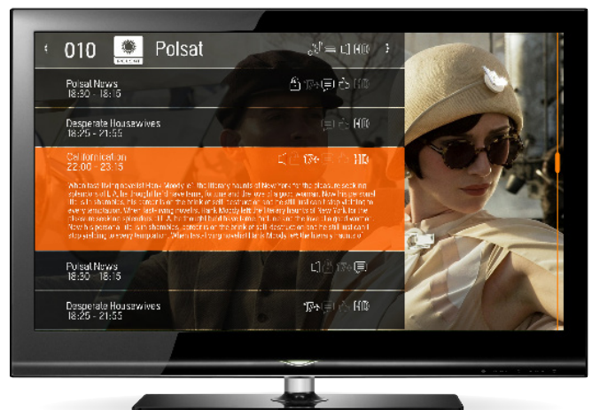
CubiTV makes it easy for viewers to find TV shows, movies, sports and more on their favorite devices.